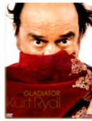
Portrait The Gladiator DVD