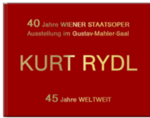
Photobook (opera houses)