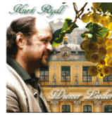
Viennese Songs Solo-CD